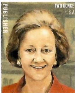
Katharine Graham 2022

On June 14, 2022 (Flag Day) the USPS issued a Forever stamp for 2 ounces commemorating Katherine Graham. (Cost 78¢.) It is the 17 th stamp in the Distinguished American Series. Graham was the owner and publisher of the Washington Post newspaper, bought by her father in 1933, and run by her husband until his death in 1963. She became the very first woman to be the CEO of a fortune 500 company. She took a big risk in 1971 when the Washington Post published the controversial “Pentagon Papers.” In 1972, the Washington Post reported on the break-in of Democratic National Committee headquarters, located in Washington, D.C. at the Watergate complex. This led to a scandal, eventually resulting in the conviction of John N. Mitchell, who was the 67 th Attorney General of the United States (from 1969 to 1972), and the resignation of President Richard M. Nixon in 1974. 48 people eventually were convicted. Katherine